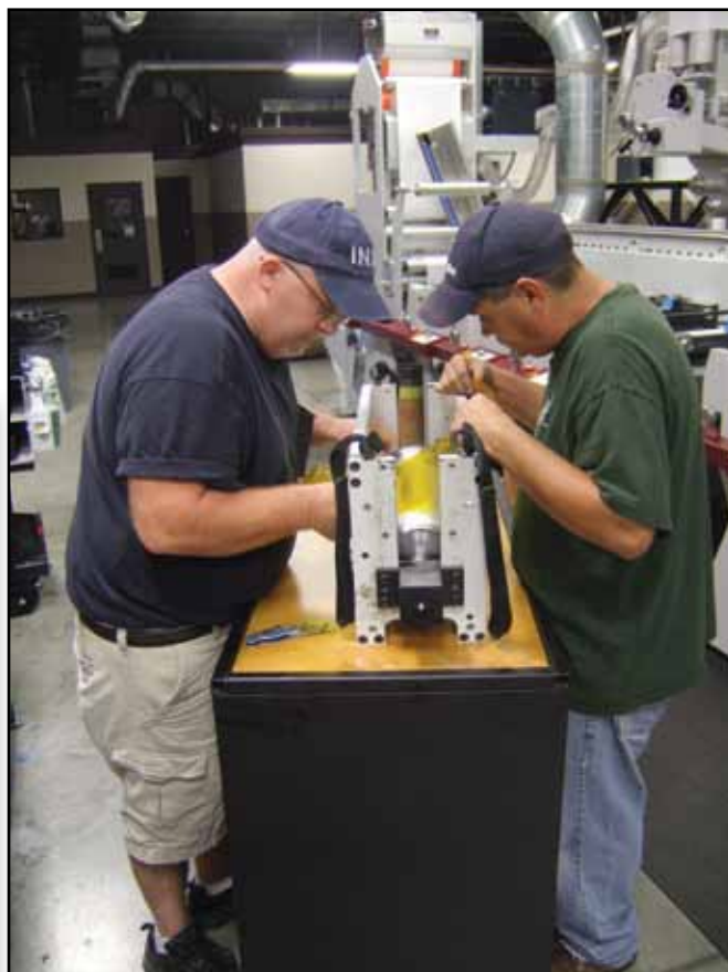
Mounting the embossing plate.

Step #3: Customize files in prepress before proceeding to platemaking. With Publishers handling the ordering of the embossing cylinders from Rotometrics and the tactile varnish sleeve from Stork Prints, the cold foil application was done with a MacDermid DMAX .045-in. plate with an adhesive for applying the cold foil in the outline of the word FLEXO . 3M comes on board here, contributing a special tape for the embossing plate station—3M 2205—and a second special tape for cold foil—3M 1515. The responsibility for art file adjustments for special effects; namely embossing, cold foiling and tactile varnishing, come with formal hand-off to Dixie Graphics. The trade shop has been handling prepress and platemaking for Publishers since installation of its first flexo press in November 2010.