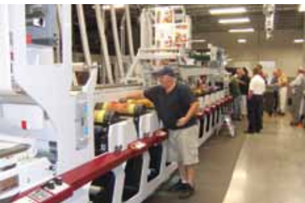
Thornberry removes lint/dust from plate.