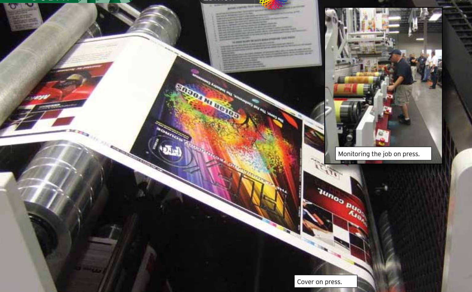
Monitoring the job on press.