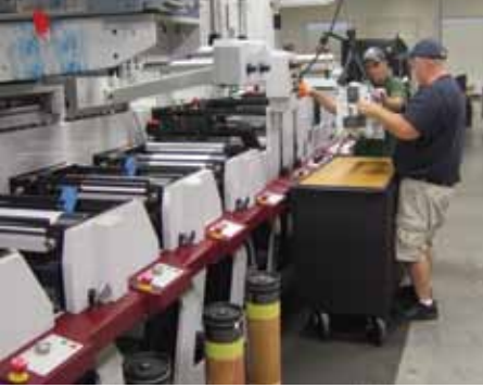
Lifting embossing cassette into the press.