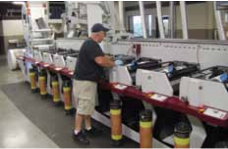
Thornberry positions anilox roll on press.